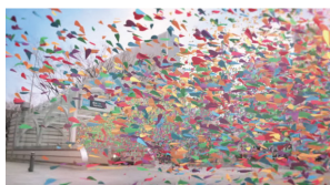
TOKYO2020 “Tomorrow begins”