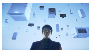
“Forest of Home Appliances”