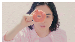
“Sakura Mochitto Donuts”