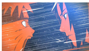
"ROAD TO NINJA -NARUTO THE MOVIE-"