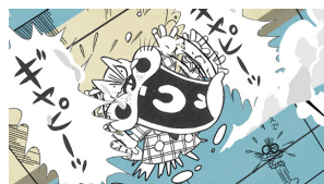
"Memorial Exhibition for Fujio Akatsuka"

©Masashi Kishimoto Scott / Shueisha, TV Tokyo, Pierrot ©NARUTO Movie Production Committee 2014