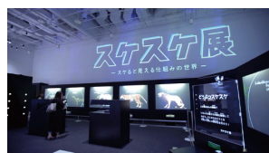
"SUKE SUKE EXHIBITION -A look inside the world-"