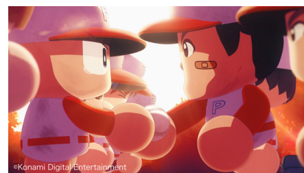
"eBaseball Powerful Pro Baseball 2022"