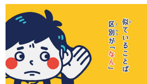
"Nanchou Nan Nan"