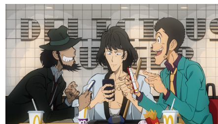
"LUPIN THE 3rd x McDonald's"

© Monkey Punch / 2019 LUPIN THE 3rd Film Partners