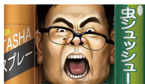
"A sheet that eliminates ticks"