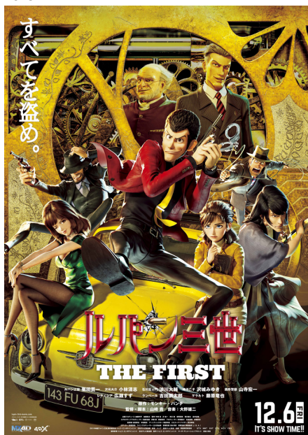
"LUPIN THE 3rd THE FIRST"