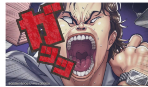
"PIP MAGNELOOP MAX x BAKI"