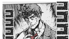
XPS Web ad Dell Japan