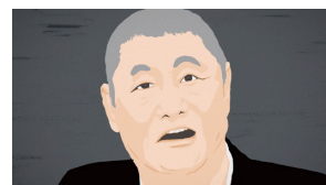
“Asobi tai wa,kataomoi. Asobu wa ryō omoi.” Corporate ad ZENT Co., Ltd.