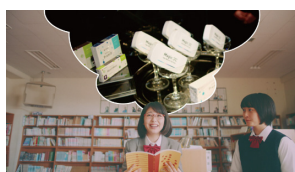
“Miru: Moshimo Shop” Web ad Menicon Co., Ltd.