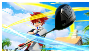
NEKO GOLF Opening Movie COLOPL