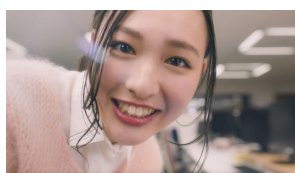
HOT PEPPER beauty Web ad Recruit Holdings Co.,Ltd.