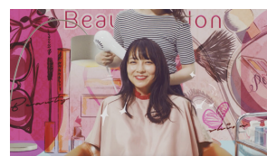
HOT PEPPER beauty“Fukuoka girl” Web ad Recruit Holdings Co.,Ltd.