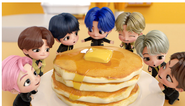
GEORGIA×TinyTAN TV ad Coca Cola Japan

-Short movie “We Lab Music” /SPACE SHOWER TV Station ID ★PROMAX&BDA (2002) /SILVER