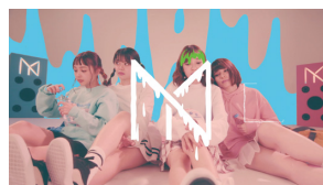
“White Cube” Music video Yasutaka Nakata