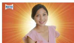
“Ace your spring cleaning with Magiclean!” TV ad Kao Singapore