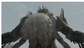
“COME ON! Kanmon!” PV Kitakyushu City, Shimonoseki City