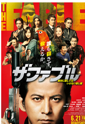
“THE FABLE” Movie ©2019 “THE FABLE” production committees