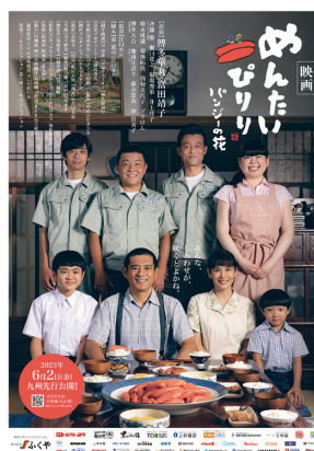
“MENTAI PIRIRI -Pansy Flowers-” ©2023 "Mentai Piriri" production committees