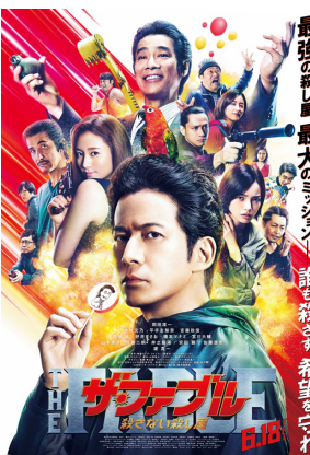
“THE FABLE : The Killer Who Doesn’t Kill” Movie ©2019 “THE FABLE : The Killer Who Doesn’t Kill” production committees