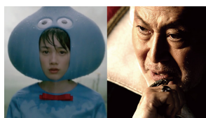
Dragon Quest Monsters: Super Light “Nakama ni shiteyo” “Ryuu Toujou” etc. TV ads SQUARE ENIX Co., Ltd.