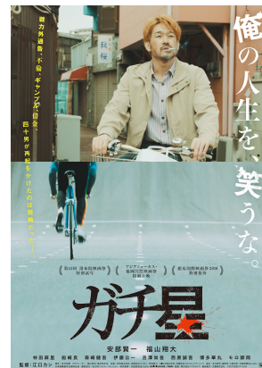
“Riding Uphill” ©2017 KOO-KI, PYLON