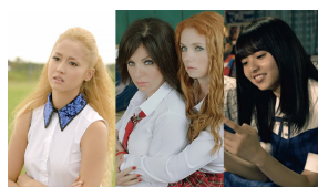
Snickers® “Soccer” “Baseball” & “Dokuzetsu Idol” etc. TV ads TM © Mars